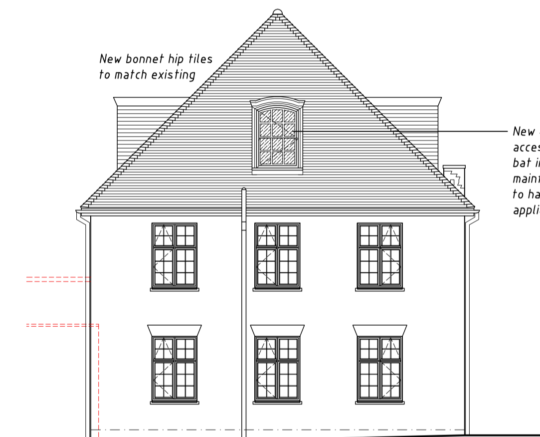
Side (North) Elevation - West Wing

This drawing is to be read in conjunction with drawing C1292/OM/202.A approved under Planning Application Reference:12/03810/REM