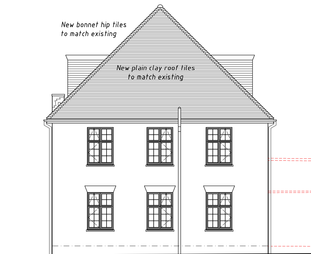
Side (South) Elevation - West Wing